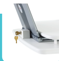
Optional Security-ready Laptop Mount