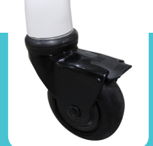
Optional Omega Casters