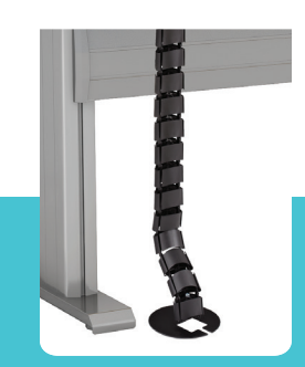
Flex Wire Management FCM490