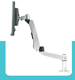
Hover Series 2 Monitor Arm HS3111